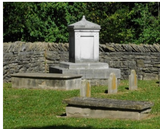
Isaac Shelby's Tomb