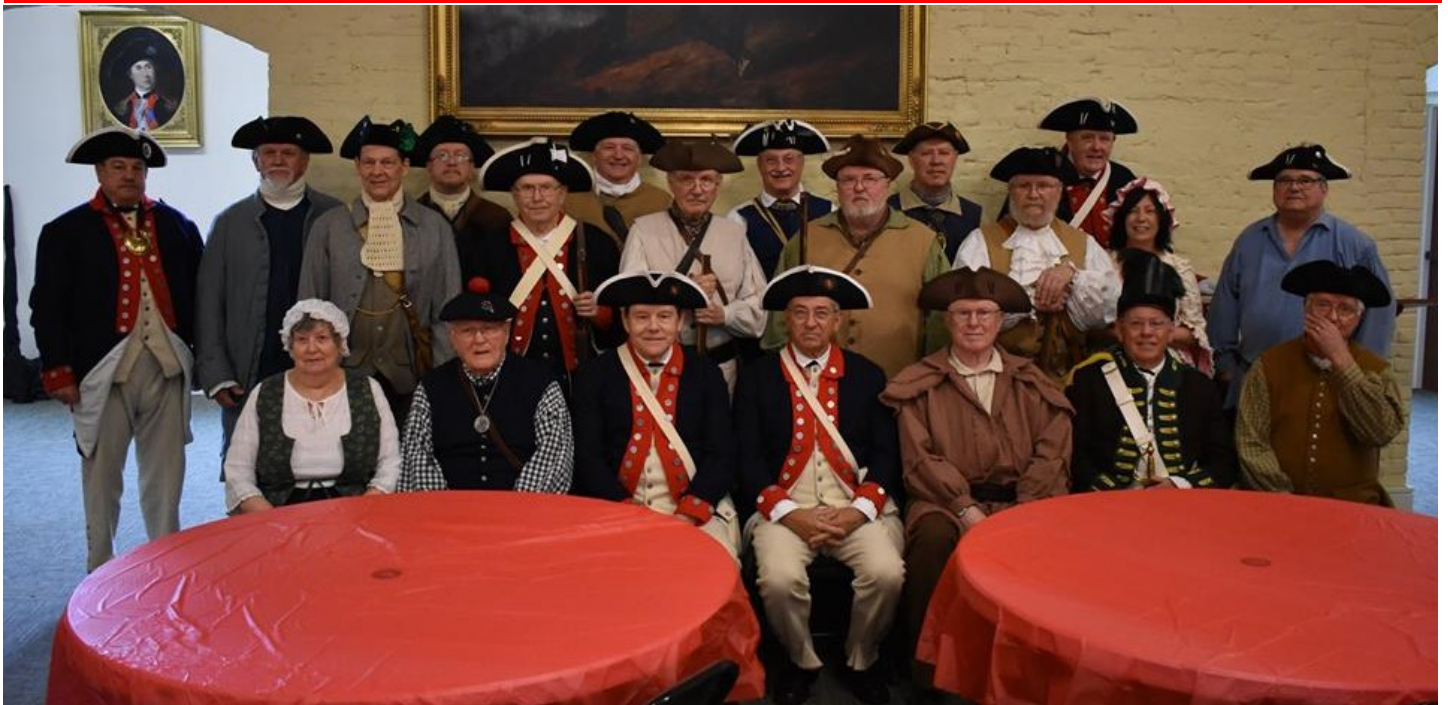
Eleven of our members took part in the recent naturalization ceremony.