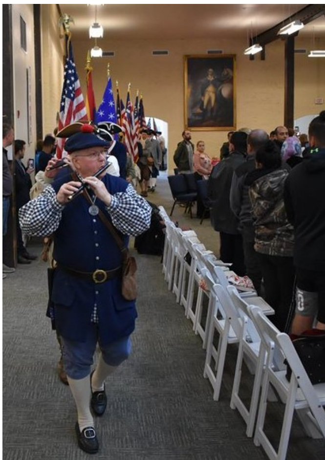
Color Guard entering the room.