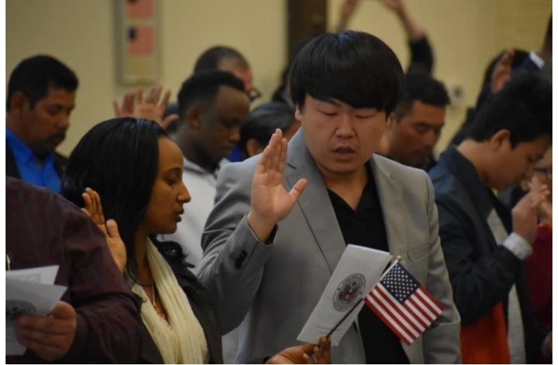
Taking the oath of allegiance