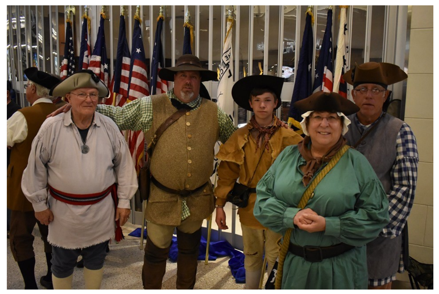
Painted Stone Settlers