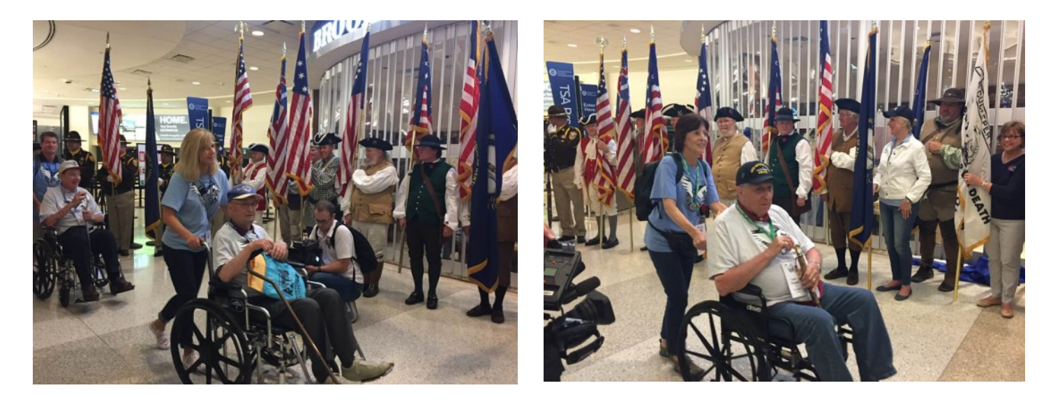
Veterans returning to Louisville from their trip to Washington D.C.