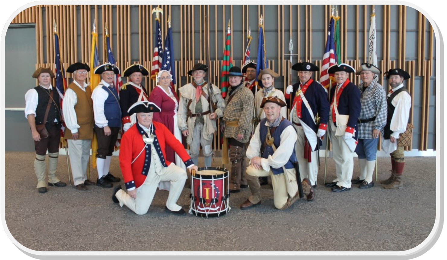
Compatriots from the following chapters took part in the opening and closing ceremonies: Lafayette, Louisville Thruston, Simon Kenton and Gov. Isaac Shelby.