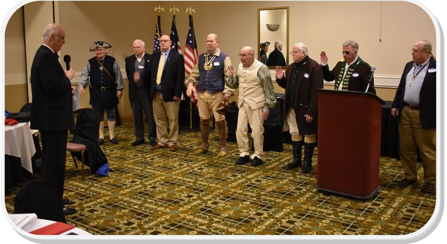
State officers for 2020-21 sworn in at the state meeting.