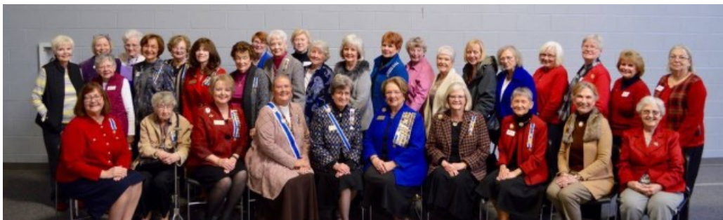
DAR members at the Religious Freedom Day ceremony.