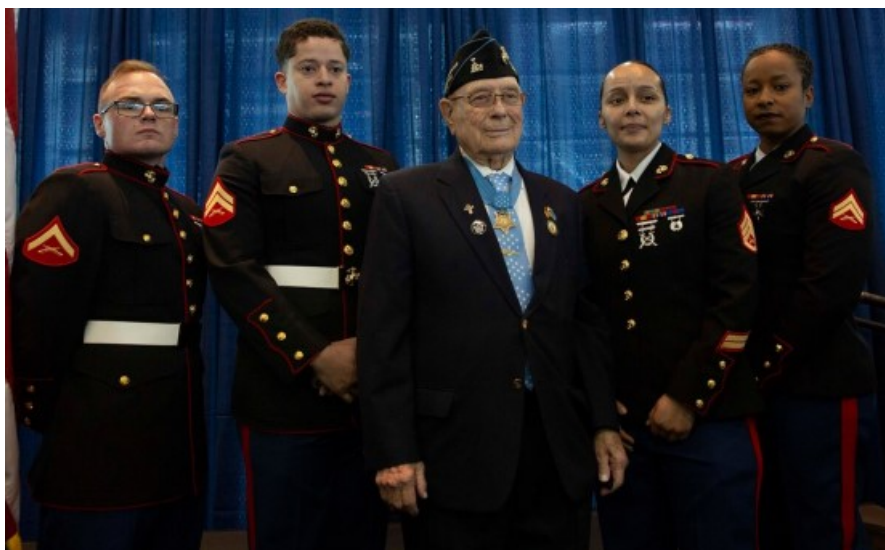
World War II Medal of Honor recipient Hershel Woodrow “Woody” Williams, a retired U.S. Marine, and U.S. Marines with Fleet Marine Force Atlantic, U.S. Marine Corps Forces Command, pose for a photo after the ship commissioning ceremony for the USNS Hershel “Woody” Williams at the Half Moone Cruise and Celebration Center in Norfolk, Va., on March 7, 2020.