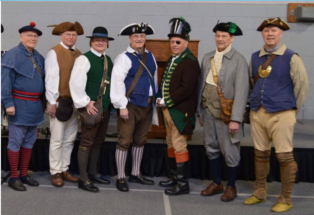
SAR members at the Religious Freedom Day ceremony.