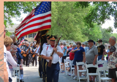
Marching in the Colors