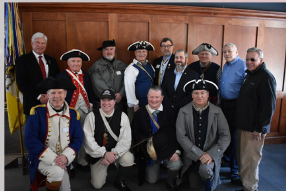
Compatriots of the Governor Isaac Shelby Chapter