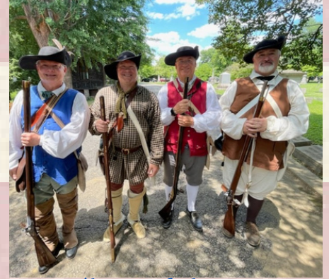
That's a Motley Crew