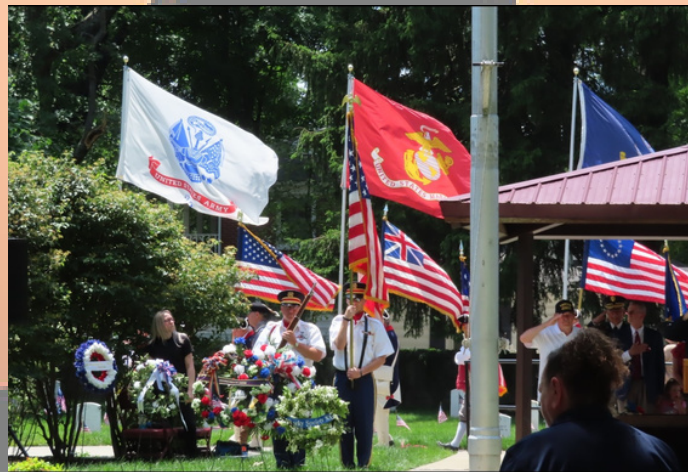
Posting the Colors