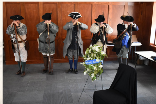
KY State Society Color Guard Giving Honor