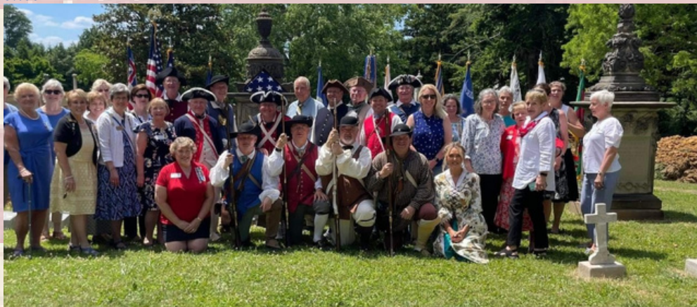
Members of the SAR & the DAR