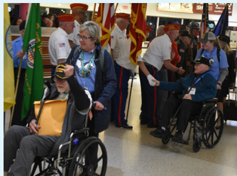
Honor Flight Vets HUZZAH!!!!