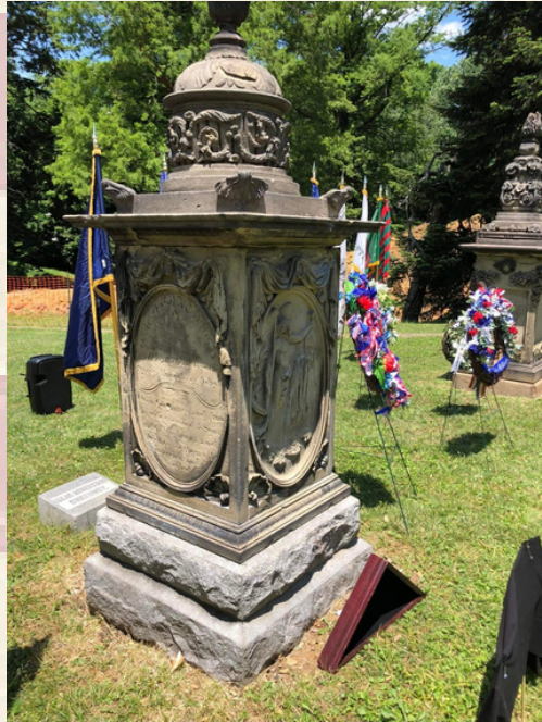
Owen Gwathmey Grave