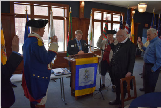
New State Officers take the oath of office