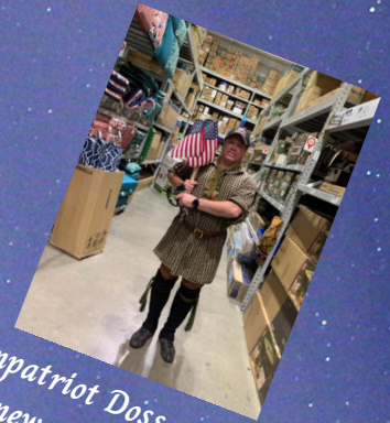
Compatriot Doss with the new color guard flags...LOL