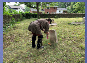
Compatriot Doss at Floyd-Breckinridge Cemetery