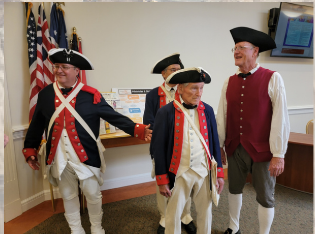
Concert at Beargrass Creek Christian Church