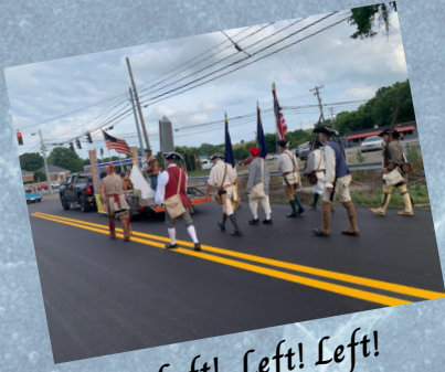
Left! Left! Left!