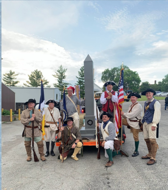
Getting Ready for the parade!!