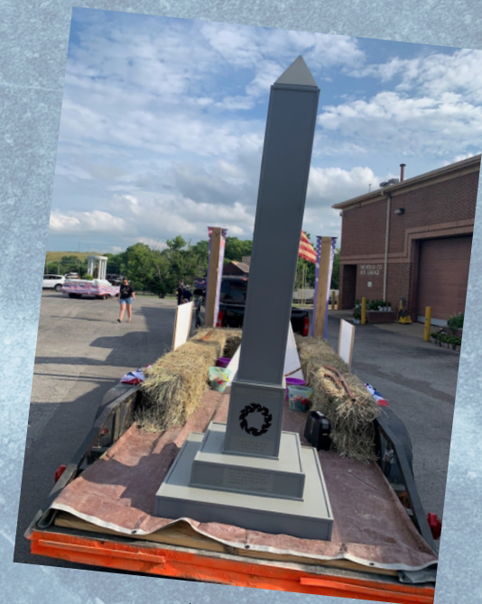
The Float Hand Made Replica of the Memorial at Blue Licks Amazing Job!!