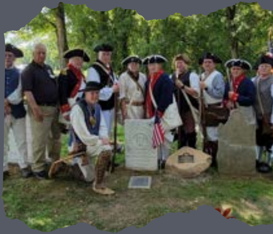
Markland, IN. Grave Marking