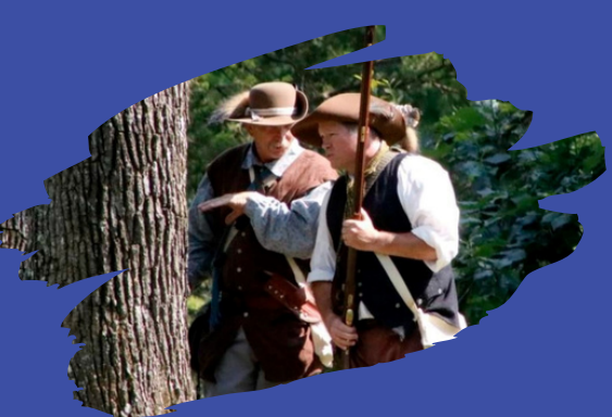
Discussing which way to run when the shooting starts!!