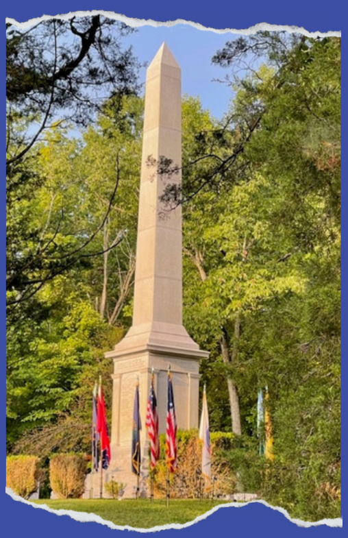
THE MEMORIAL MONUMENT