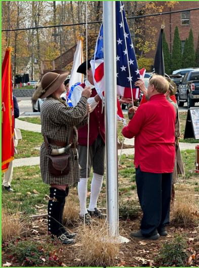
Raising the new flag