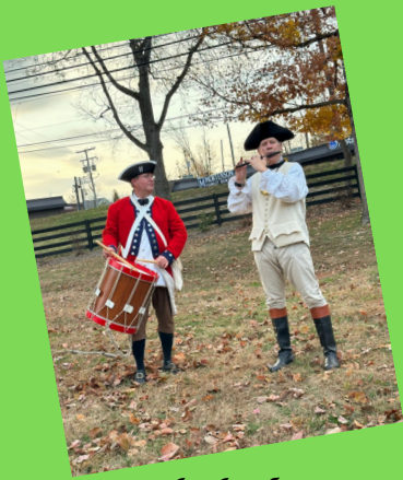
A little Music!!