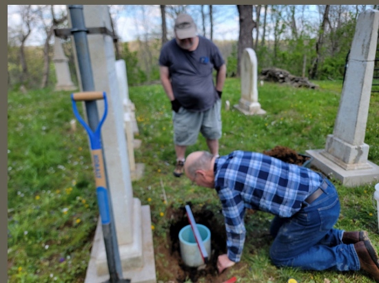
Its level already!!!