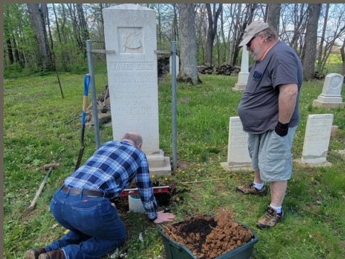
We need more dirt!